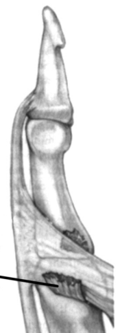
Torn ulnar collateral ligament caught on the edge of the adductor aponeurosis after injury