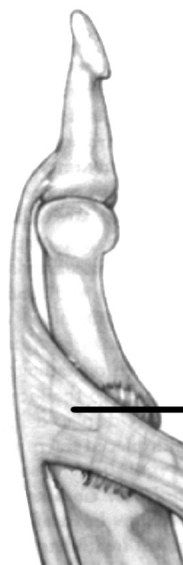
Adductor aponeurosis over the top of the ulnar collateral ligament

(sits below another strap, seen in diagram)