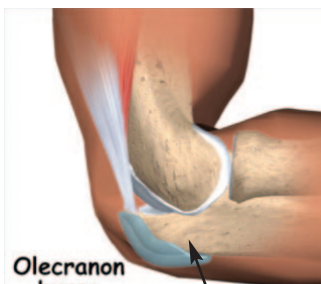
Ulna bone at elbow